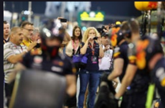
Paddock Club™ Pit Lane Walk