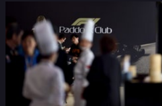
Formula 1 Paddock Club™ Hospitality