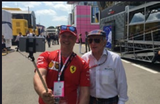
Guided Paddock Access