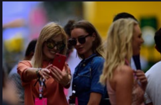
One-Day Paddock Access