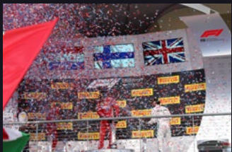
Podium Ceremony Access