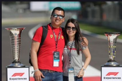
Evening Grid Walk & Championship Trophy Photo