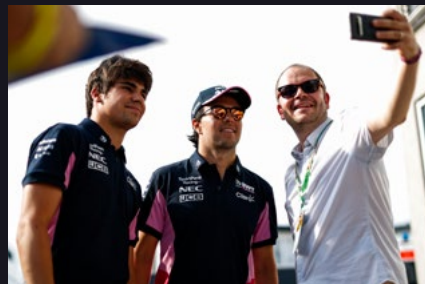
Guided Paddock Access