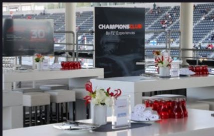
Champions Club Hospitality