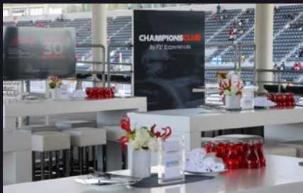
Champions Club Hospitality