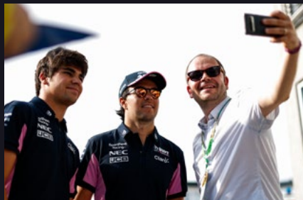
Guided Paddock Access