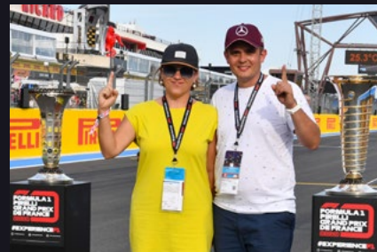
Evening Grid Walk & Championship Trophy Photo