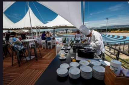
Champions Club Hospitality