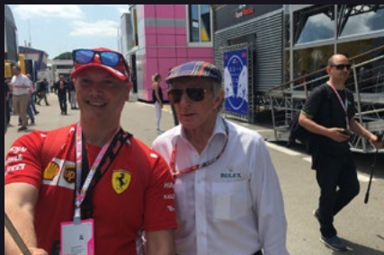
Guided Paddock Access