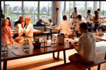
Trackside Terrace Hospitality