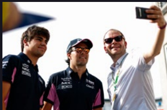
Guided Paddock Access