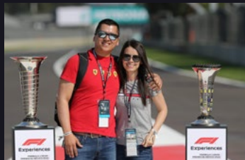
Evening Grid Walk & Championship Trophy Photo